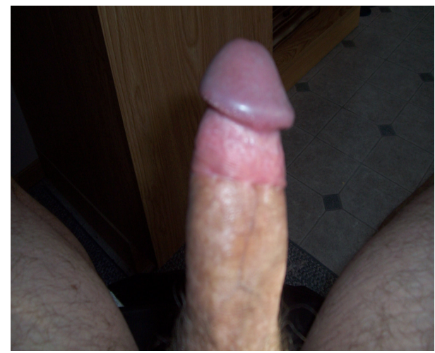
Hard, Cut 9 Weeks Post Circ

This is a true story. Here's 5 photos to show how I look at 9 weeks and 1 year post circ: